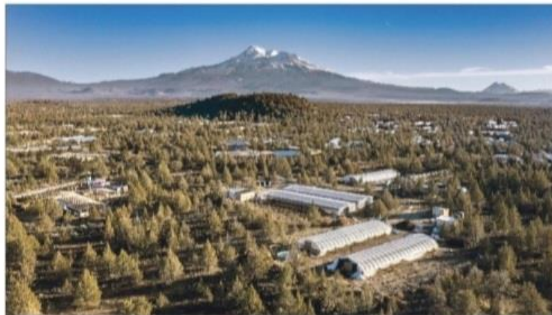
SIX YEARS after legalization with the idea of crippling the outlaw pot trade, illicit farms abound in Mount Shasta Vista, Calif.