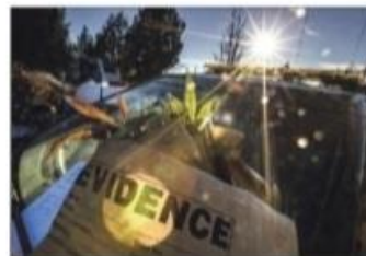
SAMPLES from a seized marijuana crop are bagged after a 2021 raid on an illegal site in Shasta County.

Instead, a Los Angeles Times investigation finds, the law triggered a surge in illegal cannabis on a scale